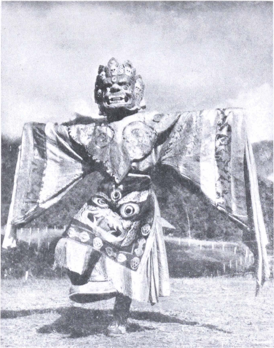
Memba Dancer, Siang