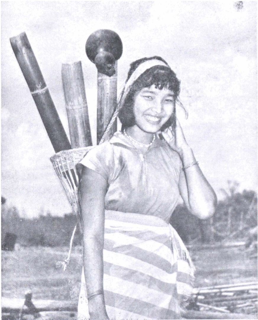
A Lushai Girl

Vitality of the Hill People is a National asset