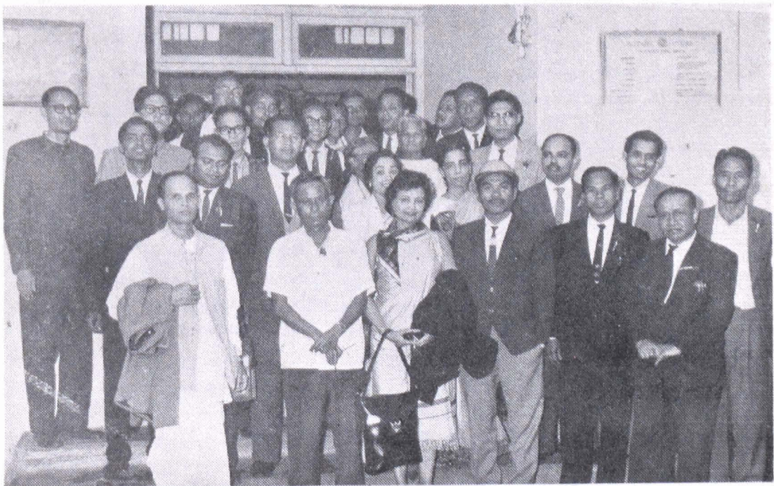
Some of the Delegates of the National Seminar on Hill People of North-East India.